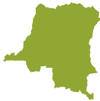
The Democratic Republic of Congo