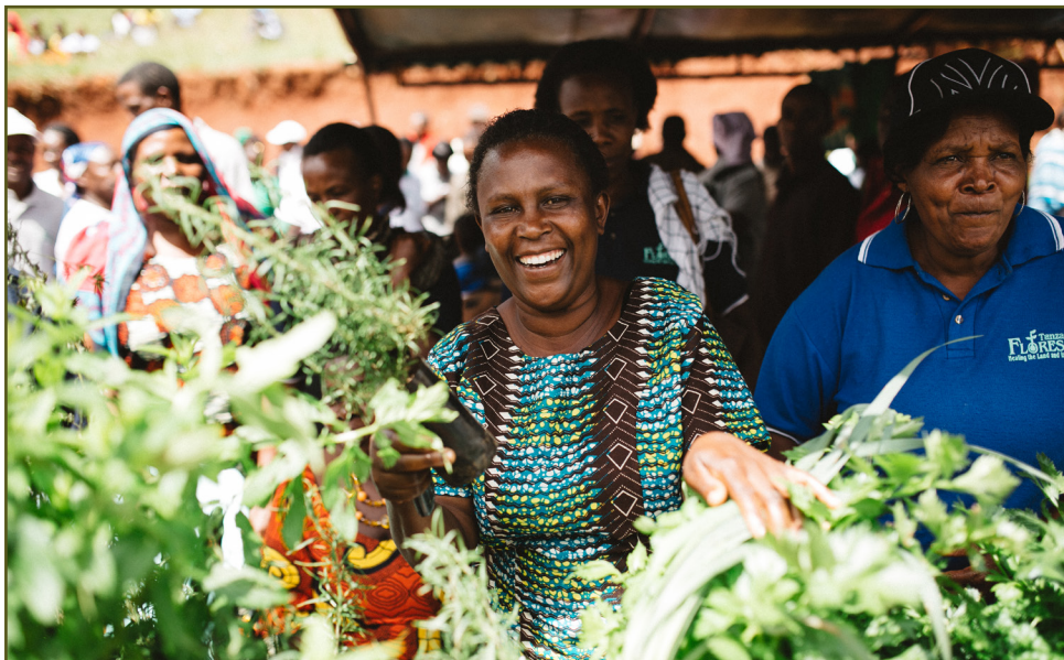
Partnering farmers in Tanzania are able to competitively sell their produce with a certified organic label.